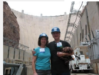
Visiting the Hoover Dam. A National Historic Civil Engineering Landmark

What advice would you give to young professionals in the organization? Your ASCE colleagues and friendships help balance out your professional experiences as a Civil Engineer. You may change jobs, but your ASCE "family" stays with you and can be a constant and positive part of your professional life. Get involved. Volunteer. Step outside your comfort zone. Give presentations.