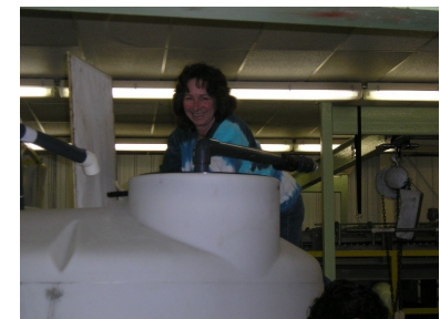
2004/2005 - Girdwood Wastewater Treatment Facility Membrane Bioreactor (MBR) Pilot Plant Project – WE engineers were the operators! From installation thru monitoring AND cleaning up all messes!

Other volunteer organizations or experiences that you'd like to share? Besides ASCE, I actively volunteer in local and national dog groups. I am a charter member of Alyeska Canine Trainers (ACT) in Anchorage and have served in most positions on the Board. I am currently President of the national American Chesapeake Club. I am also active in a few other local dog clubs.