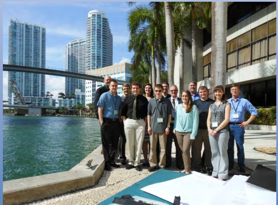
MRLC attendees from the Central PA Section, Bucknell University, and Pennsylvania State University

The Section thanks the members who attended for their continued dedication to the society and to the civil engineering profession in general. Next year's MRLC will be held in Pittsburgh, PA on February 12th-13th.