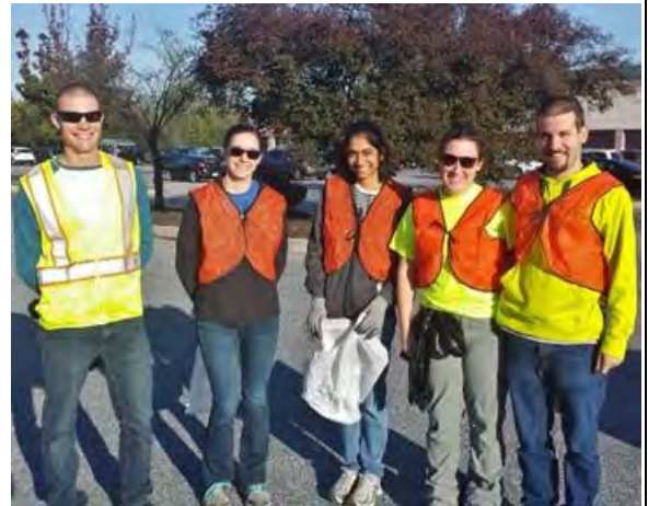
Fall Adopt-A-Highway Litter Clean-up Volunteers

In other exciting news, The YMG wrote a successful grant proposal for an ASCE Student Transition Activity (STAY) Grant. The YMG was awarded $1,000 to help promote interaction