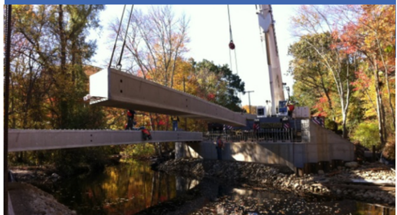
Below: Longest Integral Abutment Bridge Route 184 over Whitford Brook, Stonington, CT

CSCE would like to gather together pictures from projects around Connecticut for its new Biggest in State campaign. The goal is to promote major civil engineering projects in Connecticut. If you know of the longest bridge, tallest building, deepest cut, highest embankment, etc. (be creative), please send a brief description and a photo of it to admin@csce.org for inclusion in the next CSCE newsletter and on the CSCE website.