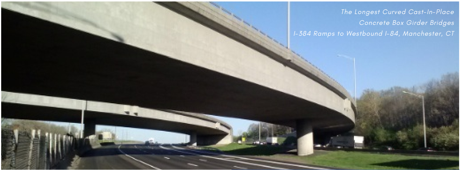
The Longest Curved Cast-In-Place Concrete Box Girder Bridges I-384 Ramps to Westbound I-84, Manchester, CT