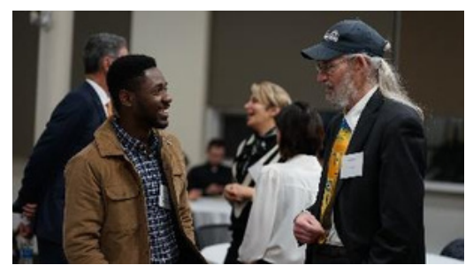
2023 CSCE Dinner Meeting at University of New Haven, pictured above