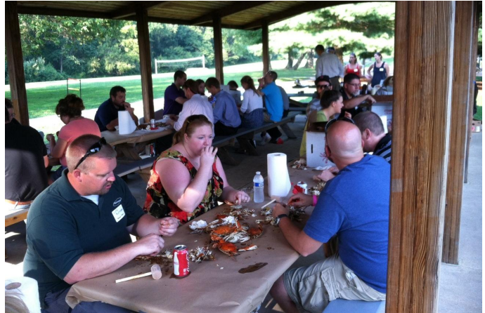
Let the feast begin! Members enjoy fresh steamed crabs from Captain's Catch

As the sun began to set and many crabs had been devoured, it was clear that the Annual Crab Feast was a great success. The section would like to thank everyone in attendance for making the Crab Feast so successful. A special thanks to Corrado Construction Company for providing all of the alcohol. Everyone in attendance had a great time and the Section looks forward to hosting it again next year, so mark your calendar!