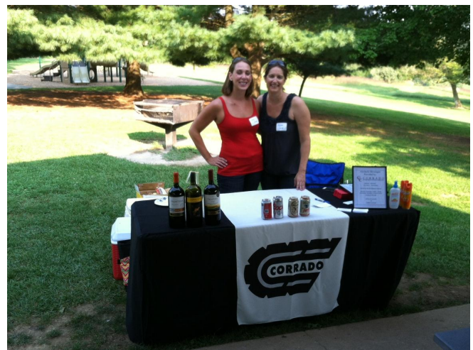
A variety of cold beer and wine was served compliments of our friends from Corrado Construction Company