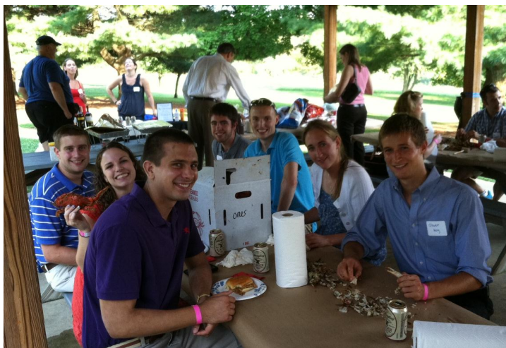
The University of Delaware Student Chapter was well represented this year with many members in attendance