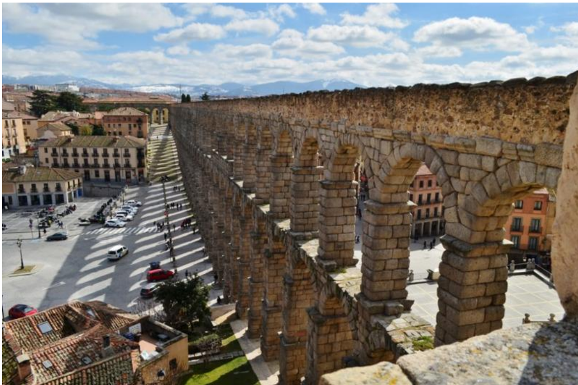
Aqueduct of Segovia