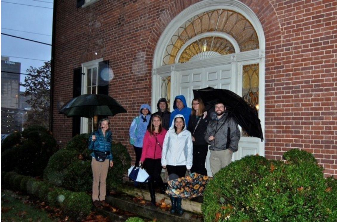
Photo of the Blue Grass Younger Members on the Historic Downtown Walking Tour

The group is planning a social event in February and a service project for April.