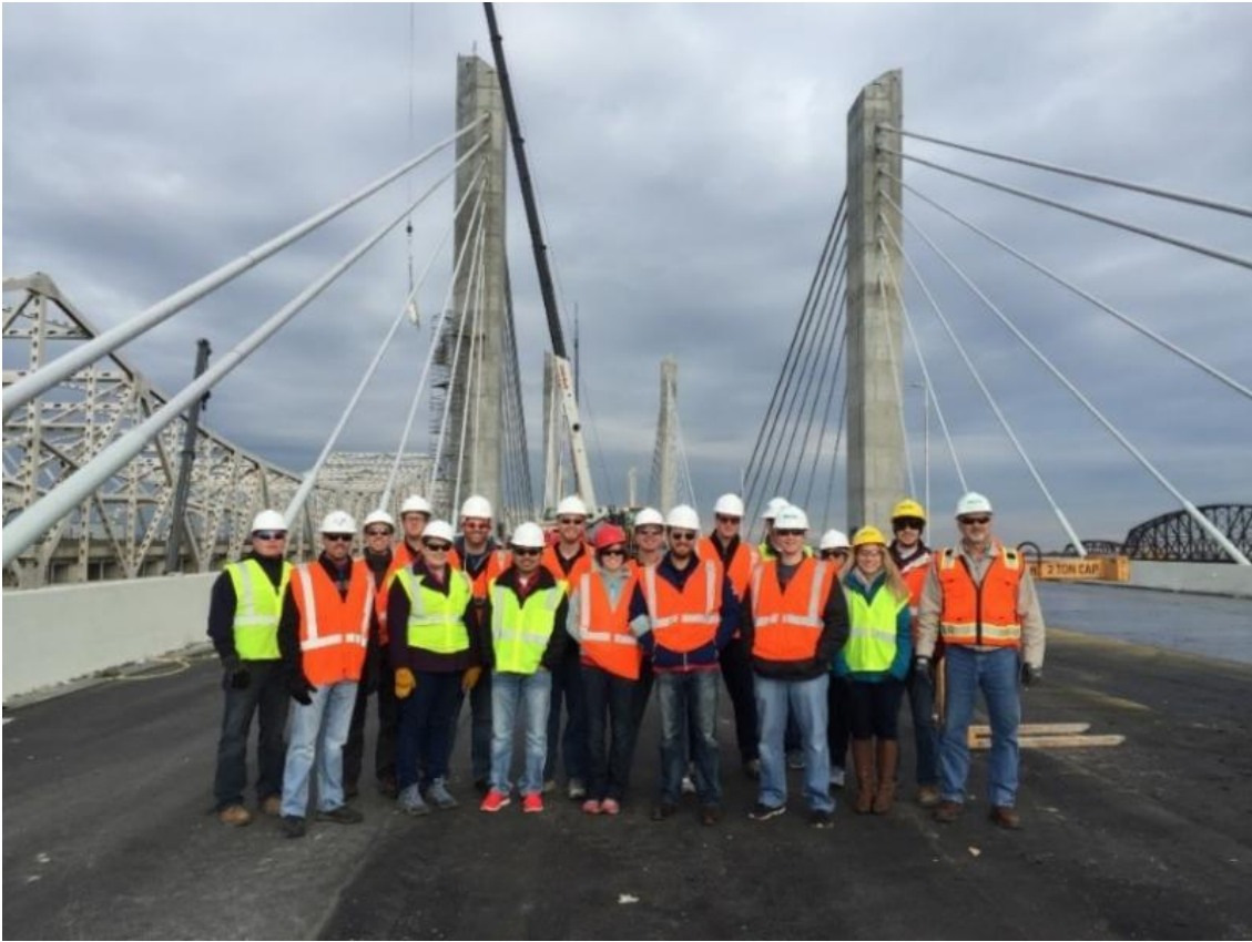
Photo of the Louisville Younger Members on the Ohio River Bridge

the Louisville Branch YMG on a tour of the Downtown Crossing project. This was a unique opportunity to see a project of this magnitude during construction, two weeks in advance of its grand opening for public viewing.