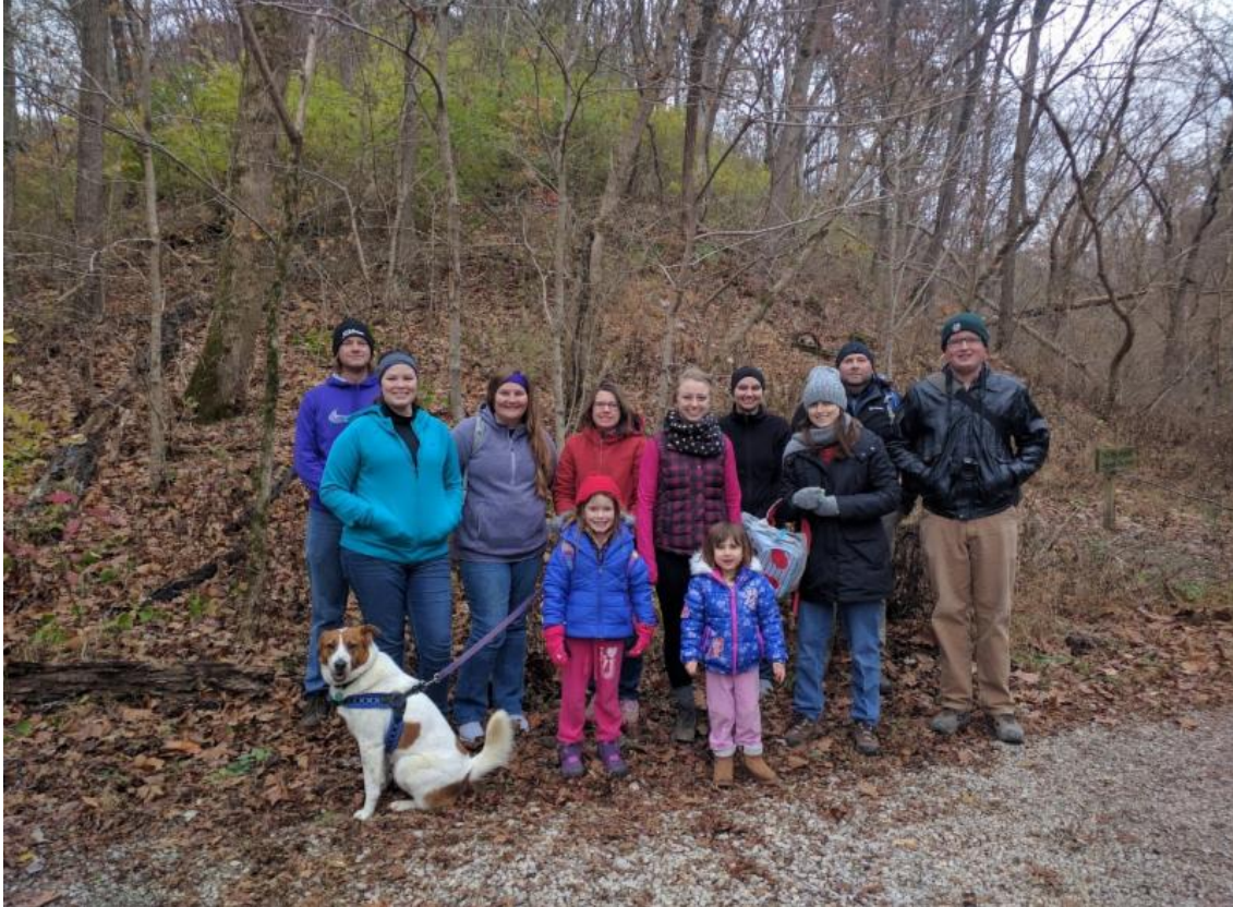
Younger Members at Cove Springs Park

In February, the younger member group met to participate in trivia night at Blue Stallion Brewery. A good time was had by all and the team finished in an impressive second place!