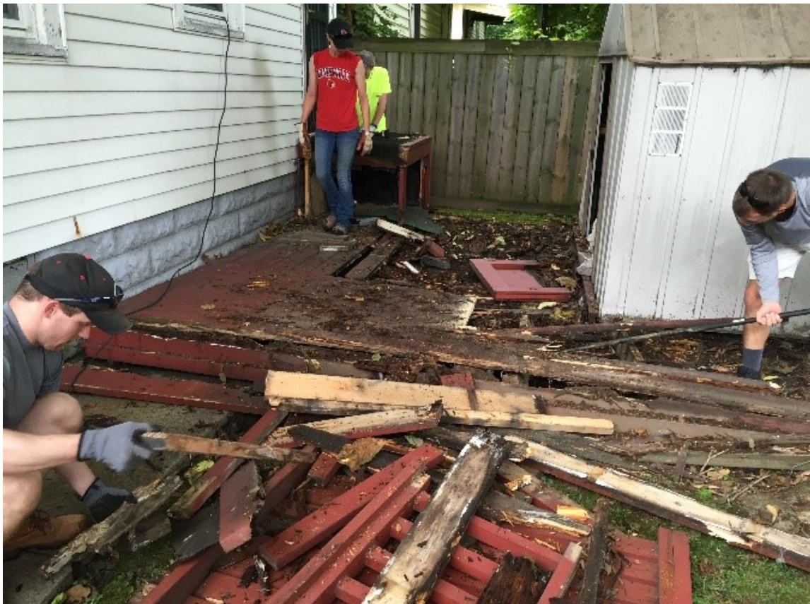
Louisville Younger Members in action at the Repair Affair last year.

LWC and Garney are coordinating to find a date for this field trip. This project includes the rehabilitation of one of LWC's oldest water mains, a 48-inch cast iron main installed in the 1920's from the Crescent Hill Treatment Plant by slip lining it with a 42-inch steel pipe.