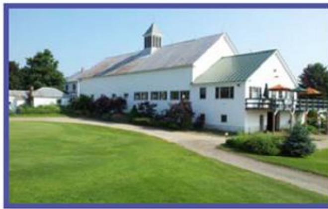
The Clubhouse at the Springbrook Golf Club

Please complete this entire form. If you are registering as an individual, please fill out the "Player 1" section only.