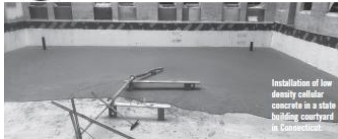
Installation of low density cellular concrete in a site building courtyard in Connecticut

CONTACT: Don LeBlanc, P.E. 207-992-3080 don@dlvews.com