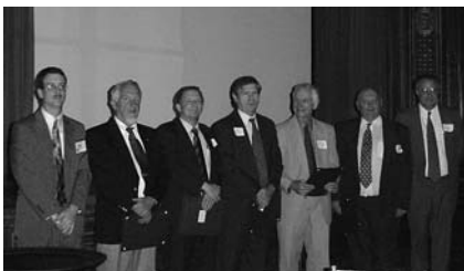
SOME OF THE LIFE MEMBERS AT AWARD CEREMONY