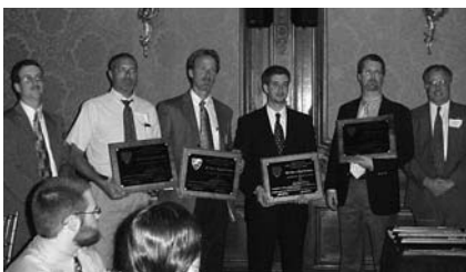
PROJECT UNDER $15M: URS Corporation