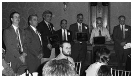
PROJECT OVER $15M: George Campbell Painting Corp.