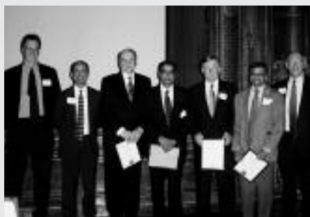
Life Member Group