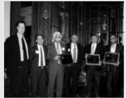
Group Award Druid Lake Fountain

The ASCE Engineering News is a monthly publication, except July and August, published by the Maryland Section of the American Society of Civil Engineers and is provided free to Section, life and student members. Interest in writing an article, comments or questions should be directed to the Editor.