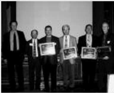
Group Award I-95 / MD 22 Interchange