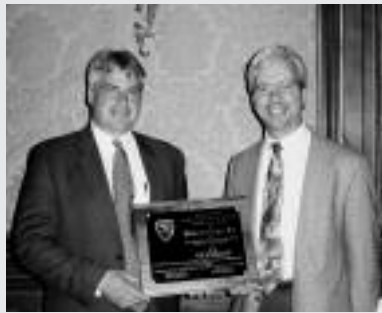
I-95 / MD 22 Project Award McCormick Taylor