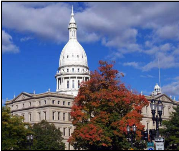
The State Capitol

The 2009 ASCE Michigan Section Annual Meeting will take place Sept. 17 - 18, 2009 at the Radisson Hotel in downtown Lansing.