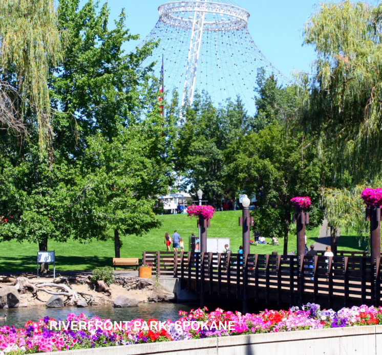
RIVERFRONT PARK, SPOKANE