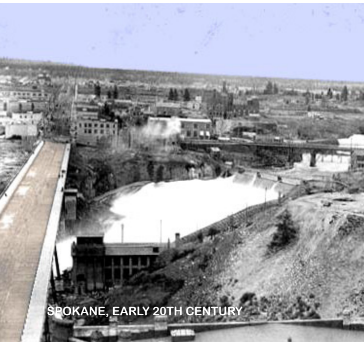
SPOKANE, EARLY 20TH CENTURY