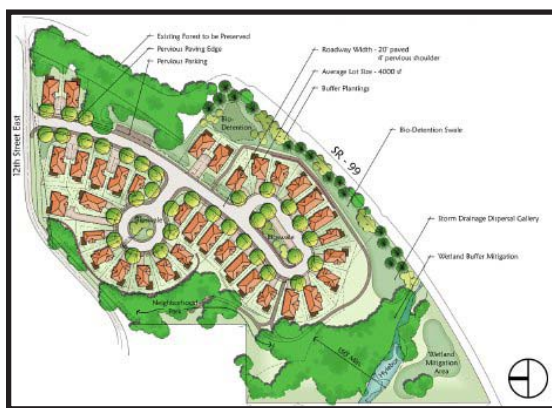
Meadow on the Hylebos

AHBL is collaborating with Puget Sound jurisdictions to develop low impact development standards for their communities. Low Impact Development (LID) is an environmentally sensitive approach to land development and stormwater management that is designed to preserve the land's natural hydrologic conditions. LID strives to mimic nature by minimizing impervious surface infiltrating stormwater through biofiltration and bioretention facilities, retaining contiguous forested areas, and maintaining the character of the natural hydrologic cycle.