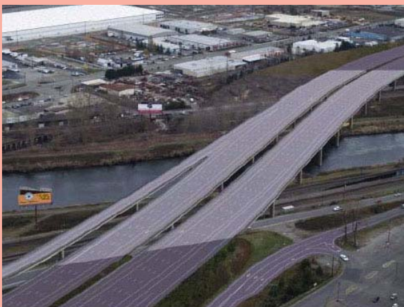
The computer enhanced photo shows the final configuration of the Puyallup River Bridges once construction is complete.

After construction is completed the bridges will be wider, have fewer piers in the water, and have a straighter highway alignment. The added capacity and straighter alignment will improve traffic flow and fewer supporting piers in the water will create a more fish-friendly environment.