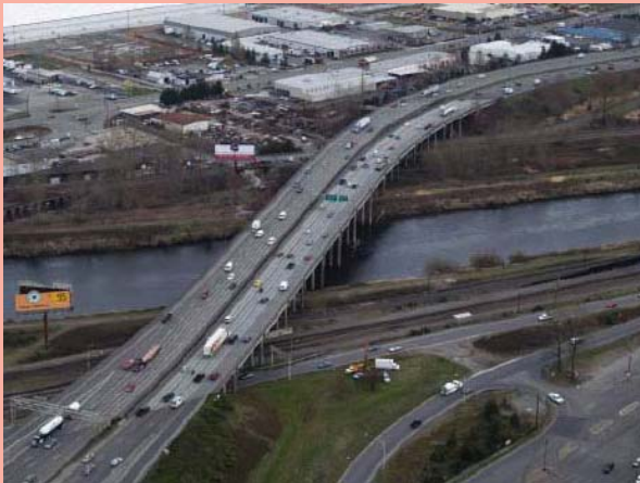
The picture above shows the current configuration of the I-5 Puyallup River Bridges