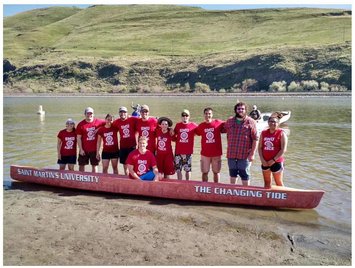
2016 SMU Concrete Canoe Team

Besides conference preparations, the SMU ASCE chapter has collaborated with the Younger Members Group to help students build a set of basic work skills before entering the professional world. On September 28<sup>th</sup>, the YMG held a networking workshop on campus. SMU ASCE looks forward to working with the YMG more in the future!