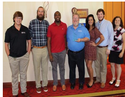
2015 Student Competition 2nd Place University of Memphis