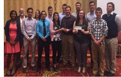
2015 Student Competition 1st Place Lipscomb University