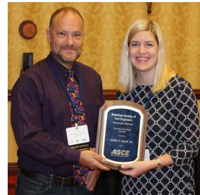
Tom Lawrence & Ashley Smith Young Engineer Award