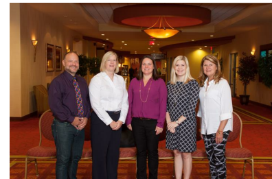
ASCE Tennessee Section Officers