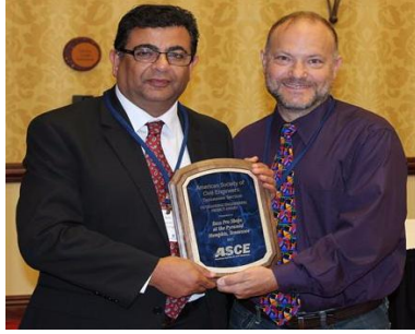
Bass Pro Shops & Lakeshore Park Abatement and Demolition Project (not pictured) Project of the Year (tie)