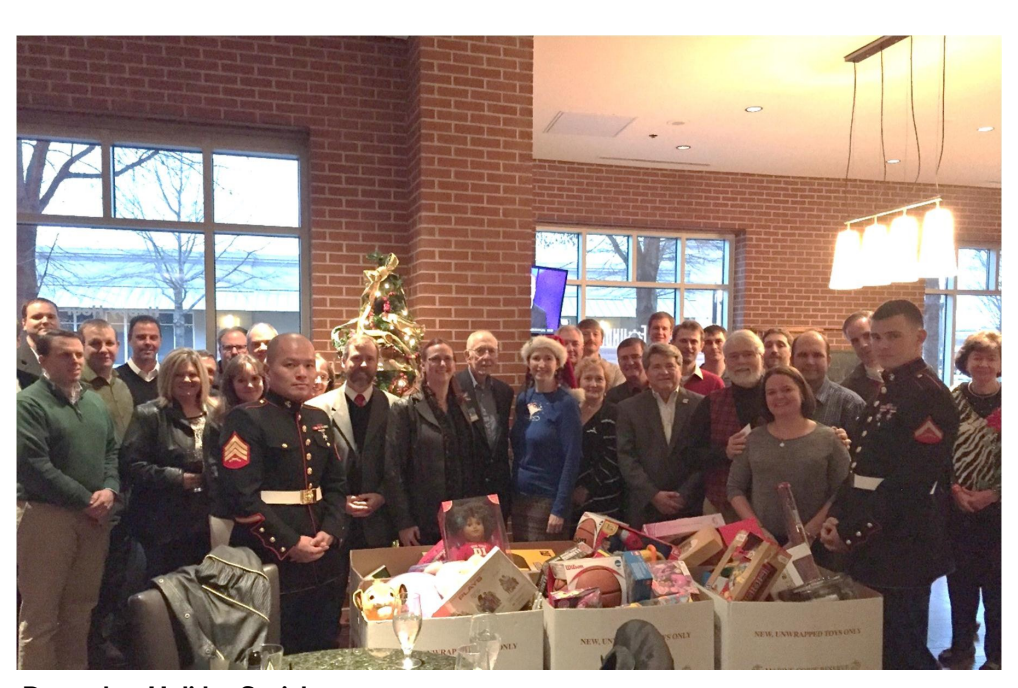
December Holiday Social

"The primary focus of the Chattanooga Branch is to continue and build on our monthly program."