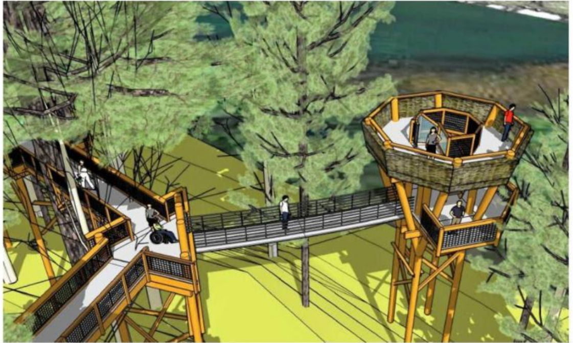
A artist's rendering of the proposed forest canopy exhibition at the Vermont Institute of Natural Science in Quechee, Vt.