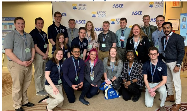
Multi-Region Leadership Conference Attendees from the Central Pennsylvania Section