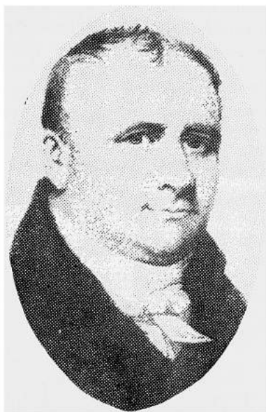
FIG. 1. BENJAMIN WRIGHT, CONSULTING ENGINEER

Discussion of the possibility of building the canal was begun at least as early as 1819, but it was January 29, 1822, before definite steps were taken to determine whether or no it would be practicable to construct the waterway, and if practicable if there would be available the necessary water supply at the required elevation. On that date representatives of some seventeen interested communities met at Farmington and authorized a committee to spend one thousand dollars for the necessary investigation.