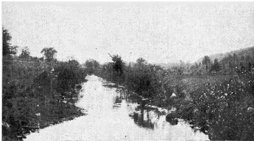
FIG. 3. SECTION OF CANAL NEAR GRANBY, CONNECTICUT.

Work on the Farmington Canal was formally begun on July 4th, 1825, when "two or three thousand people, among them several gentlemen of distinction from Massachusetts," after a prayer, a reading of the Declaration of Independence and an "able oration" marched, in a procession two miles