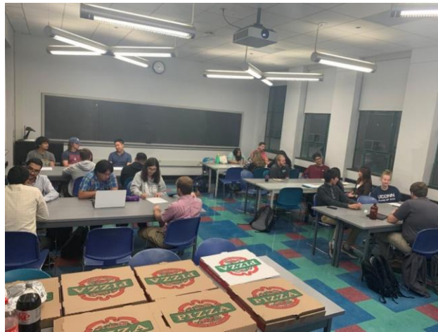
1 -UConn Resume Review

The CSCE YMG (Younger Members Group) held Resume Review Workshops at UConn and the University of Hartford in September and October respectively prior to each college's career fairs. Students brought copies of their resumes and were paired with young professionals who gave them feedback to better prepare them for their job searches. There was also overarching discussion of what our industry is like and what the students can expect when beginning their careers. The event also stressed the benefits of remaining an active ASCE member following graduation.