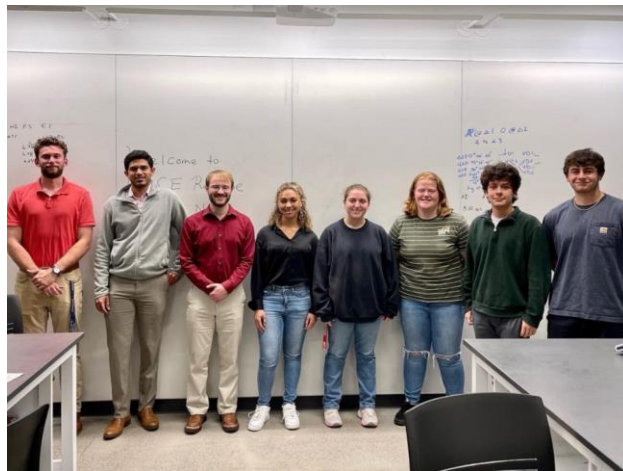
2 - UHart Resume Review Showing