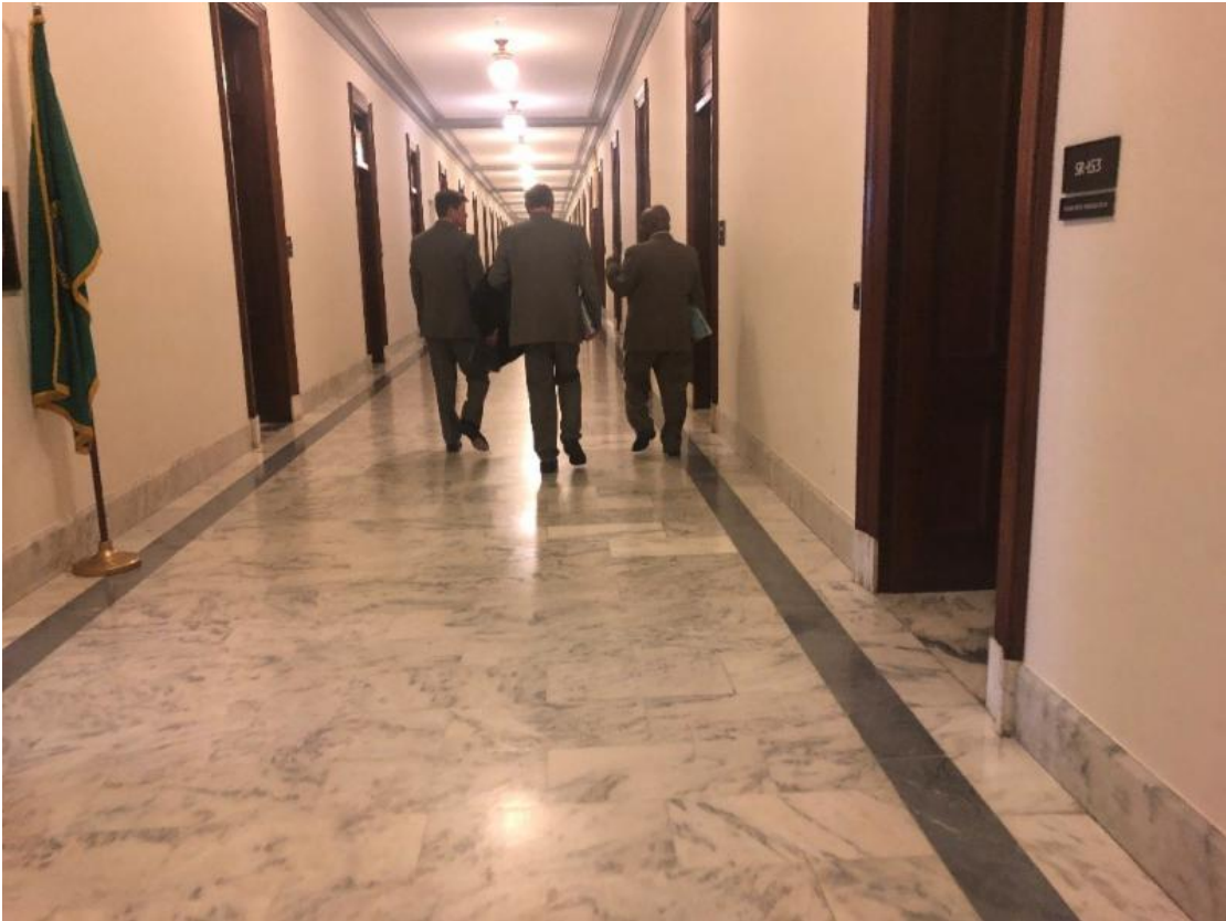
The Kentucky Delegation walks the many long hallways in the Congressional office buildings.