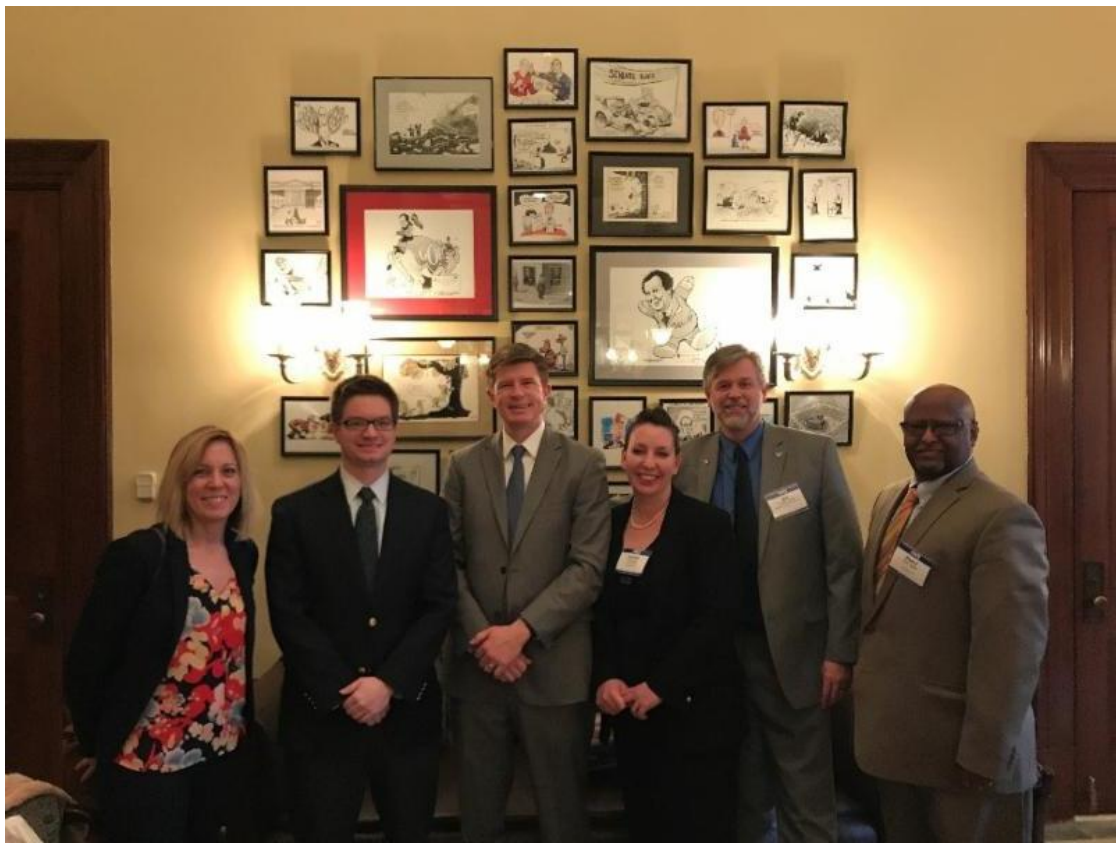
Kentucky's Delegation to the ASCE Fly-in meet with Sen. Mitch McConnell's staff in Teddy Roosevelt's former office.