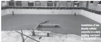
Installation of low density cellular concrete in a state building courtyard in Connecticut

DLVEWS CONTACT: Don LeBlanc, P.E. 207-992-3080 don@dlvews.com