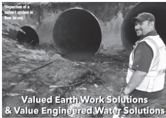
Inspection of a culvert system at New Jersey Valued Earth Work Solutions & Value Engineered Water Solutions

With specialty experience in Water Resources: - Stream Restoration - Flood Risk Mitigation - Post Construction Stormwater Management - Soil Erosion and Sediment Control