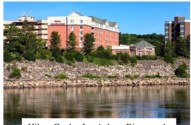
Hilton Garden Inn Auburn Riverwatch

If you are interested in sponsoring a table, please complete the following Sponsor Form.