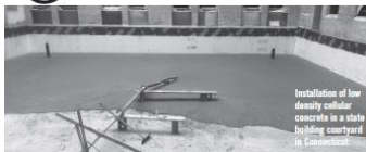
Installation of low density cellular concrete in a state building courtyard in Connecticut

CONTACT: Don LeBlanc, P.E. 207-992-3080 don@dlviews.com