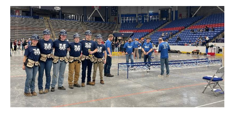
Photo Top: The UMaine Steel Bridge Team competed at the ASCE Symposium and placed 3<sup>rd</sup> in Construction Speed and 3<sup>rd</sup> in Bridge Lightness! Congrats!

Photo(s) Right: The ASCE Younger Members, Past Presidents, and Life Members toured the projects along Upper Falls Road in Biddeford and then had a networking mentorship evening with games and fun conversations at Pint and Pawn!