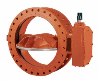
Figure No. : Typical butterfly valve

When the valve is in the open position, the disc actually extends beyond the valve body and into the adjacent pipes. Therefore, these valves cannot be installed immediately adjacent to other fittings.