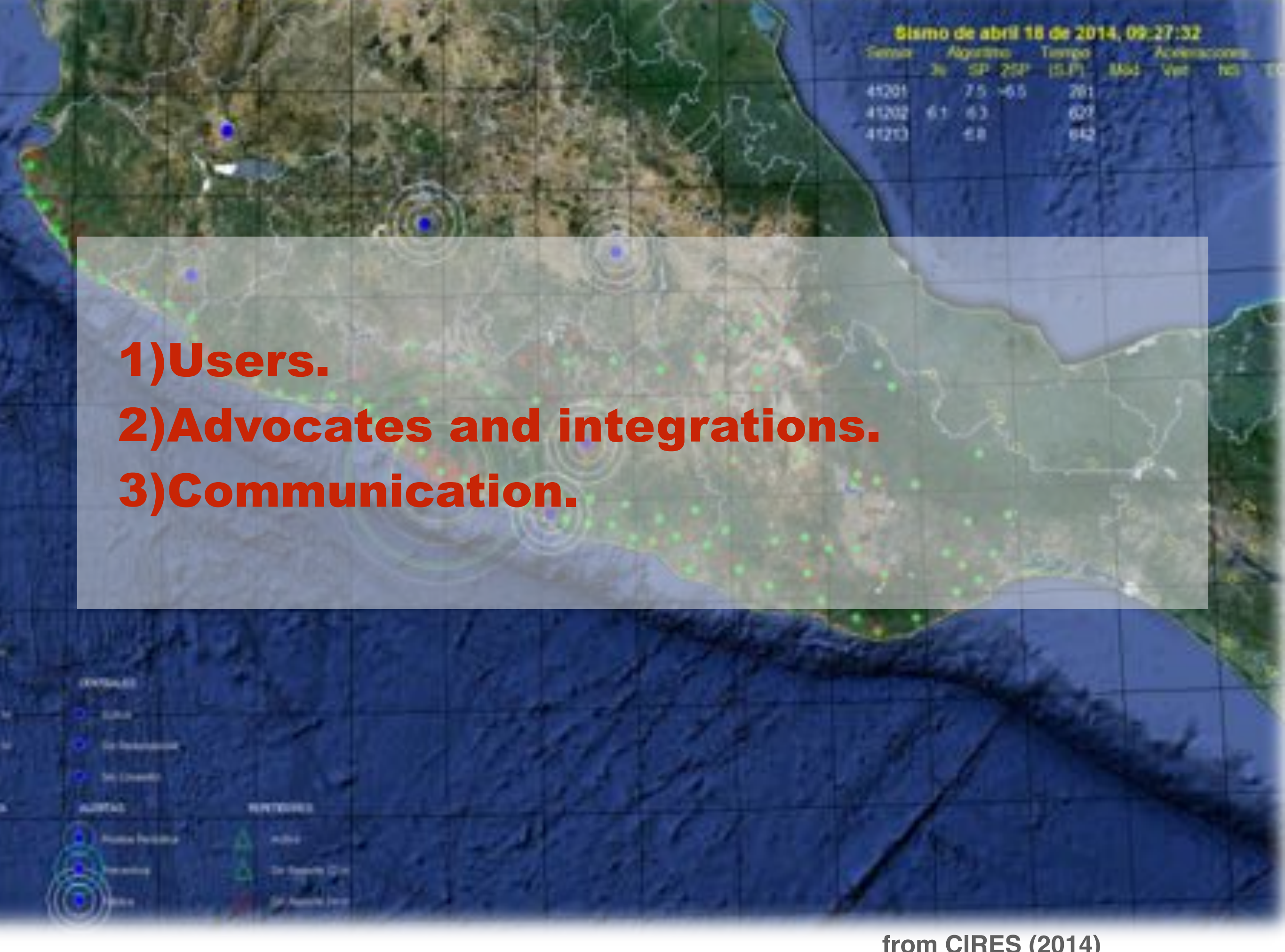
from CIRES (2014)