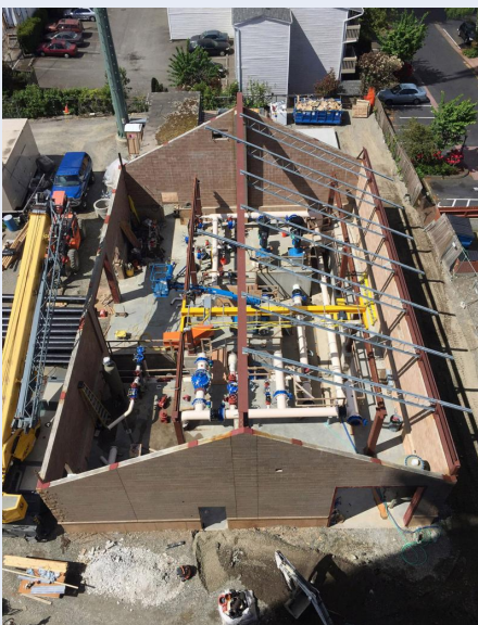
Left Photo: North City/Denny Clouse Pump Station During Construction.

The design also considered goals the District had set for sustainability, environmental stewardship and being a good neighbor. The station incorporates low impact development features, extensive landscaping, and sound attenuation of the generator and the pumps to achieve compatibility with the surrounding environment. Various features, including provisions to recirculate water for testing, permeable pavers, and a tree retention plan are incorporated to promote sustainable use of a precious water supply. Translucent panels are provided to make effective use of natural lighting and reduce energy usage. The provision of three distinct pump sizes allows the engineer to maximize pump efficiency within the various operating flow ranges, reducing pumping energy usage. All pumps use variable frequency drives, allowing the District to very closely match pumping rates with system demand, further reducing energy usage.