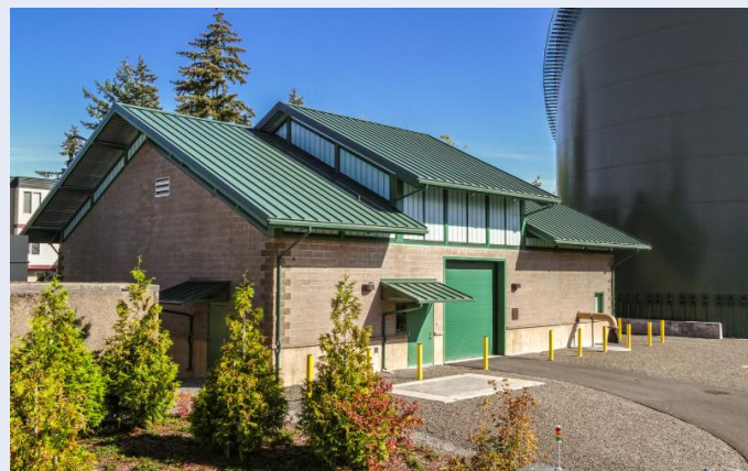
Right Photo: The station incorporates low impact development features, extensive landscaping, and sound attenuation of the generator and the pumps to achieve compatibility with the surrounding environment.