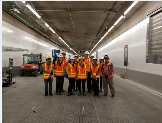
Above: SR 99 Tunnel Tour; Below: Ballard Locks Tour