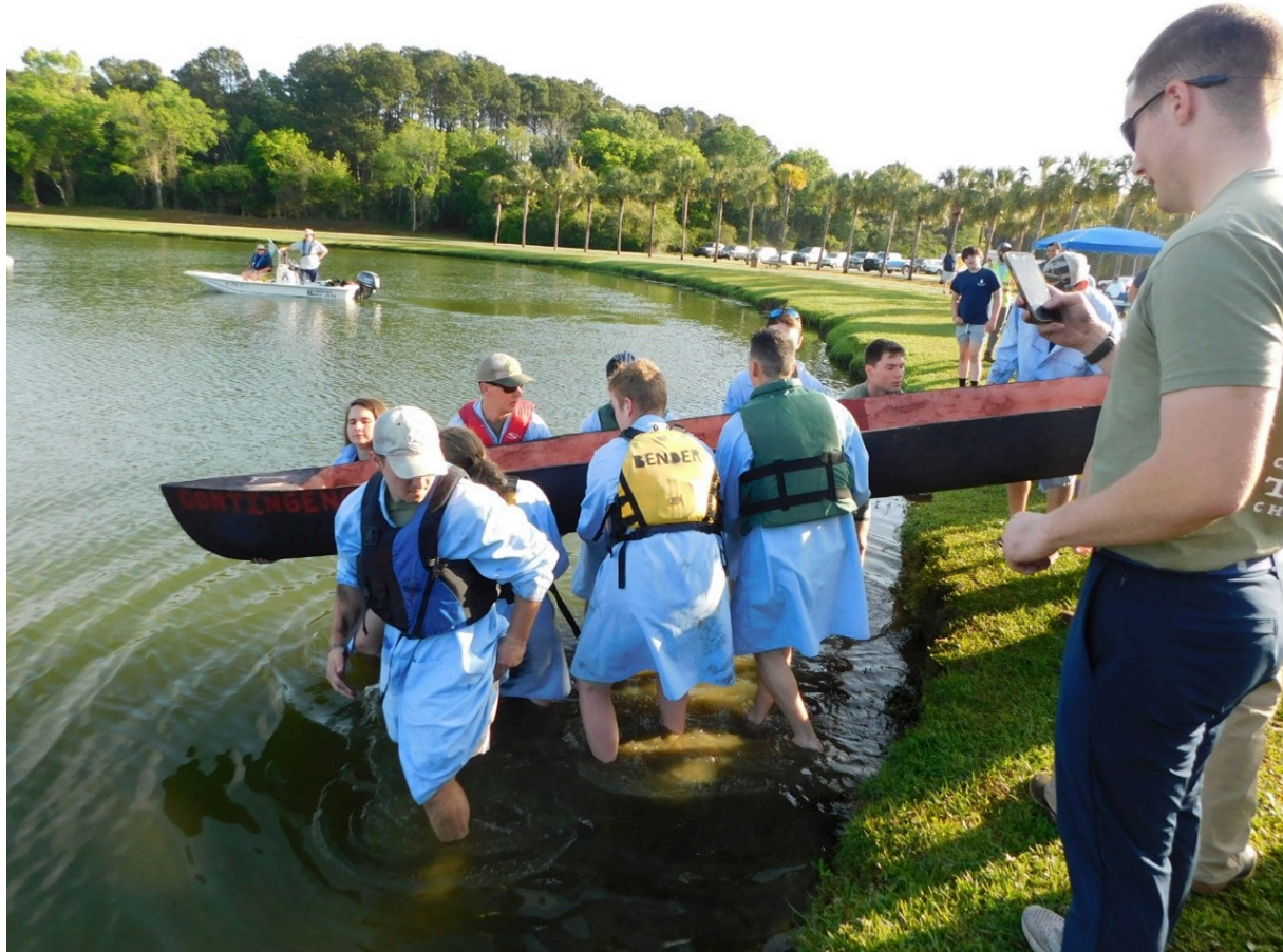
Citadel Student Chapter compete at the Carolinas Conference