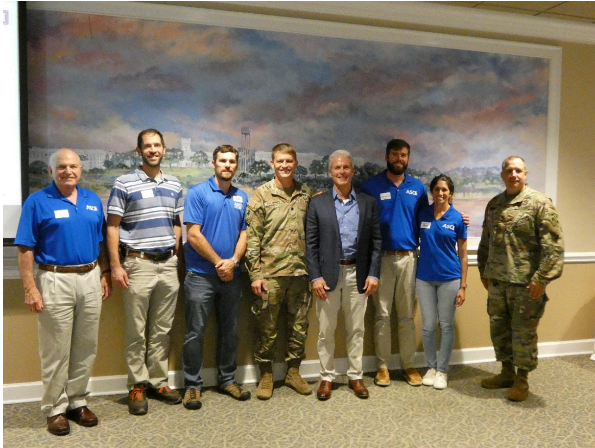
Eastern Branch Lunch and Learn