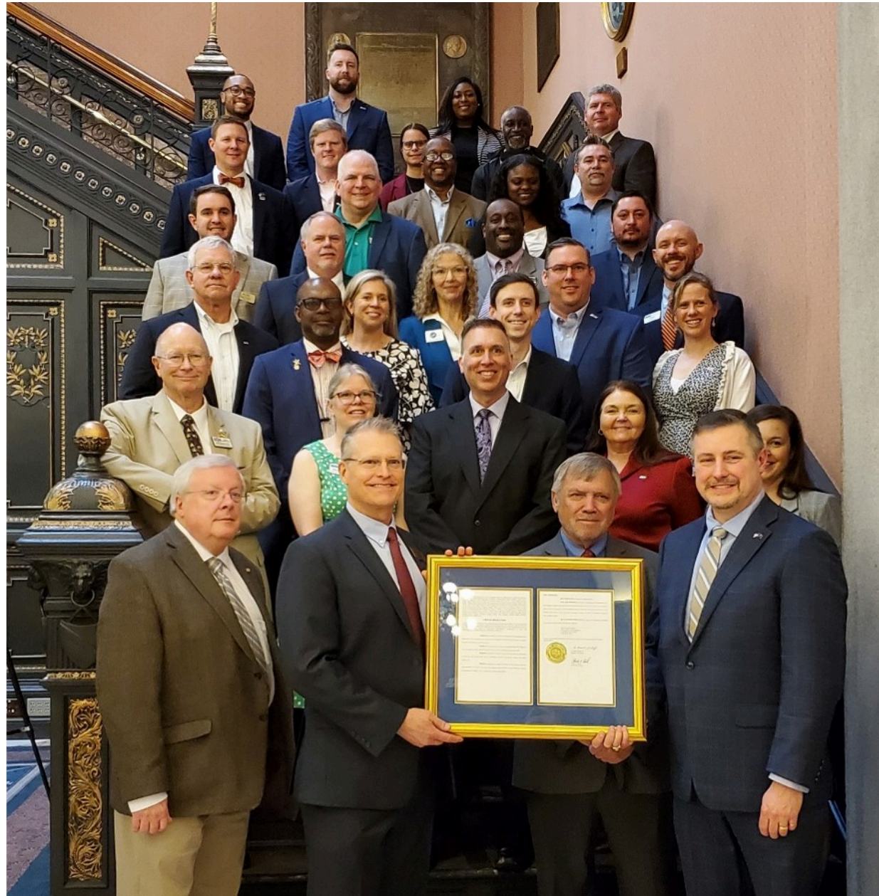
ASCE SC Section members joined with several other engineering societies to be recognized by the SC Legislators. Pictured are some attendees with the Proclamation.