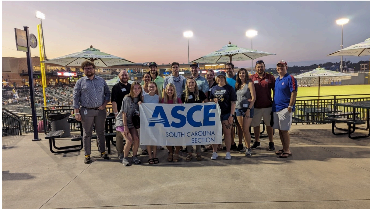
Midlands Branch Younger Member Fireflies Game