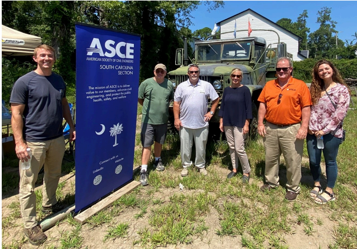
Grand Strand Branch Volunteer at a Veteran Tiny Home Project