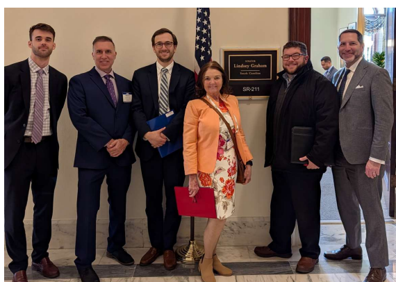
Senator Graham's Office