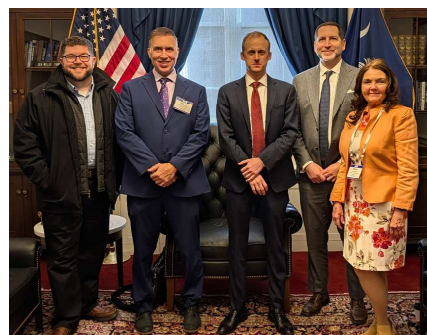
Representative Timmon's Office

We encourage young engineers and recent graduates to step forward and join future ASCE Legislative Fly-Ins. This is a powerful opportunity to learn how policy shapes our profession, build connections with lawmakers, and represent the next generation of civil engineering. Each year, ASCE hosts a day-long series of presentations and training sessions to prepare delegates—covering key legislation, messaging, and meeting best practices. Just bring your passion for infrastructure and public service. Reach out to your branch leadership to express interest and get involved early!