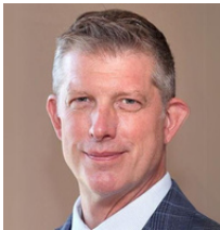
Mitch Reynolds Mayor, City of La Crosse