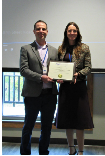
Engineering Achievement Award – Category C - Projects with Construction Cost over $10 Million and Less Than $20 Million - 87th Street Reconstruction through Milwaukee Regional Medical Campus, Wauwatosa Engineer - GRAEF; Owner - Milwaukee Regional Medical Center