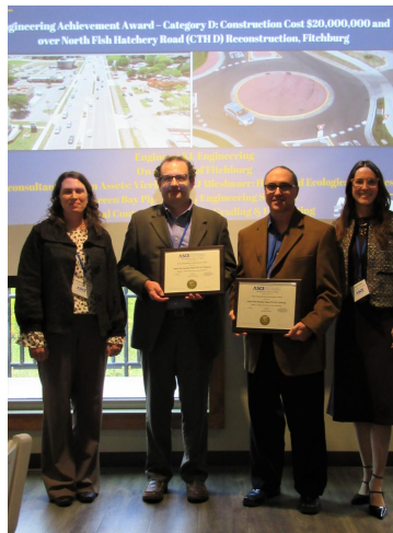
Engineering Achievement Award – Category D – Projects with Construction Cost $20 Million and over - North Fish Hatchery Road (CTH D) Reconstruction, Fitchburg Engineer - KL Engineering; Owner - City of Fitchburg

West Riverside Energy Center in Beloit Honored with ASCE Outstanding Civil Engineering Achievement (OCEA) Bronze Award